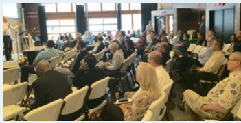
Elevate KC's first forum