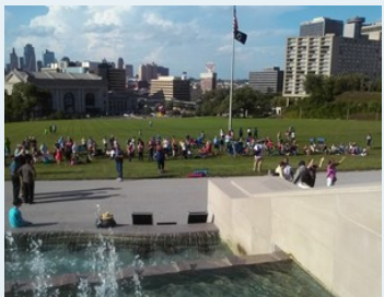
HOPE LIVES at Liberty Memorial for racial healing