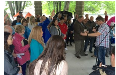
Olathe National Day of Prayer