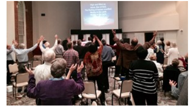
Colonial Presbyterian National Day of Prayer in KCMO