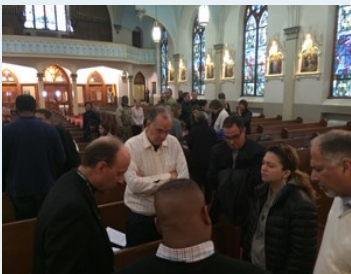
CPM prayer for racial healing at Blessed Sacrament Catholic Church, Kansas City, KS