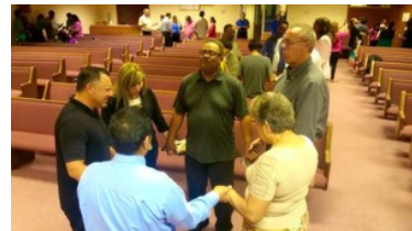
KCK Wyandotte Bilingual National Day of Prayer