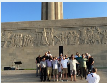
Pastors standing together asking God to bless racial healing efforts in the city