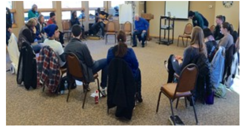
Indian Creek Community Church Leader Retreat