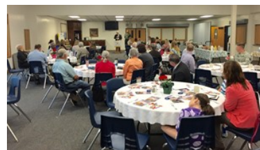
Platte City National Day of Prayer